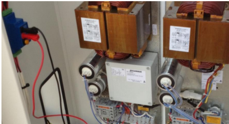
One of the dozen UBi installed on all DALI lines at Burpengary Regional Sports Park fields, clubhouse and amenities

Plug and play. Connect to the UBi with 4mm banana safety leads that suit most test tools including the Control Freak ADDICT – hands-free. Creative can also supply the leads too if required.